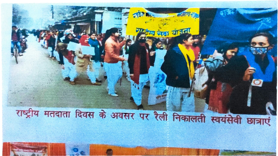
राष्ट्रीय मतदाता दिवस के अवसर पर रैली निकालती स्वयंसेवी छात्राएं