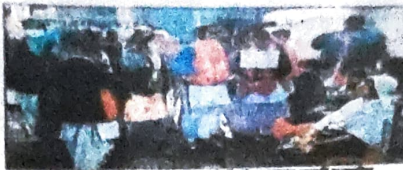
शिविर के अंतर्गत एकदिवसीय शिविर का आयोजन किया गया।