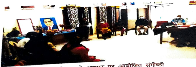
संविधान दिवस के अवसर पर आयोजित संगोष्ठी

प्राचार्य राजकीय महिला स्नातकोत्तर महाविद्यालय वाराणसी