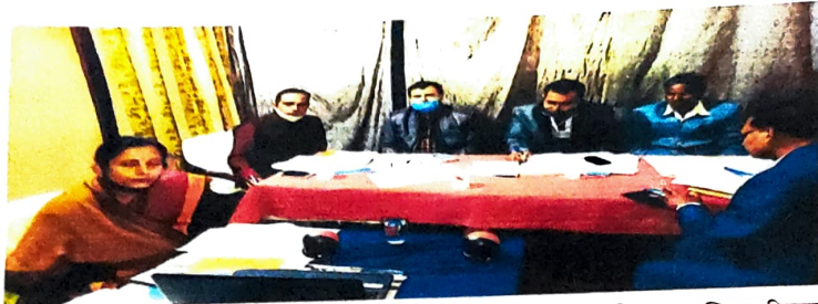
जिला स्तरीय युवा संसद कार्यक्रम में उपस्थित दृय कार्यक्रम अधिकारीगण